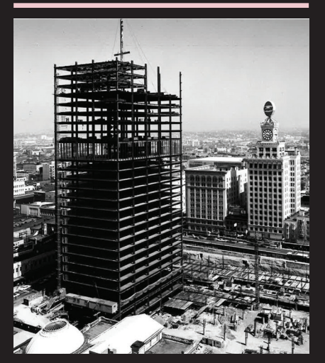
Construction begins on the TD Tower

At 127 metres (or 30 storeys) tall, it was the tallest building in Vancouver at the time, and the first modern office building in the city.